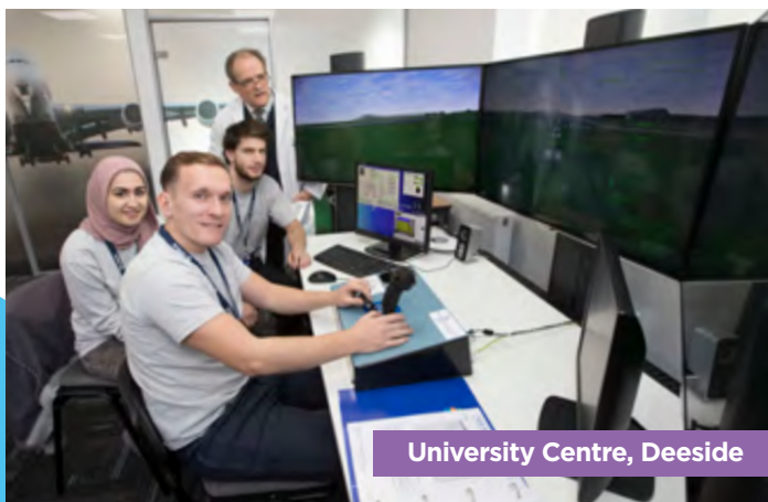
University Centre, Deeside