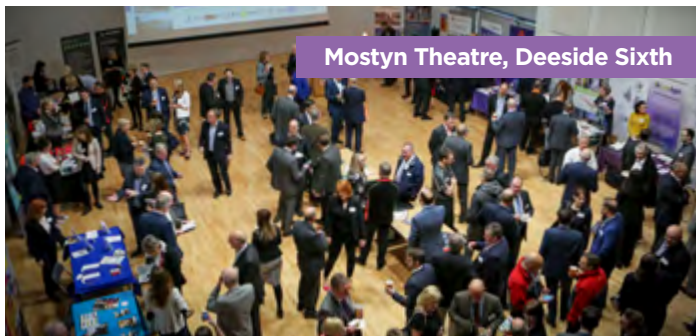
Mostyn Theatre, Deeside Sixth

Cambria for Business has invested in world-class learning facilities including the Cambria Business School at Northop, the Engineering University Centre at Deeside and the Engineering Technology Centre at Bersham Road.