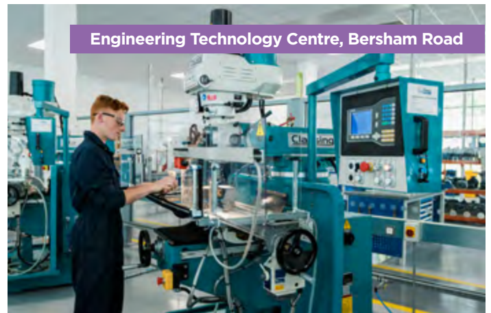
Engineering Technology Centre, Bersham Road