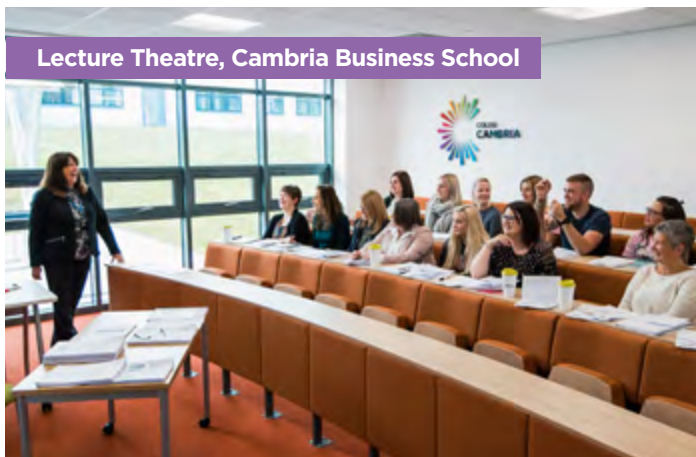
Lecture Theatre, Cambria Business School