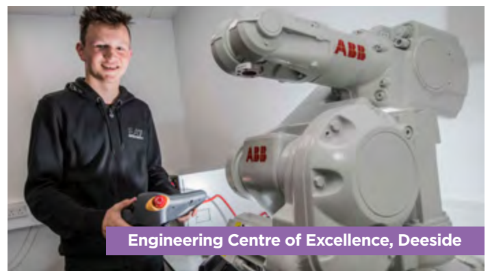
Engineering Centre of Excellence, Deeside